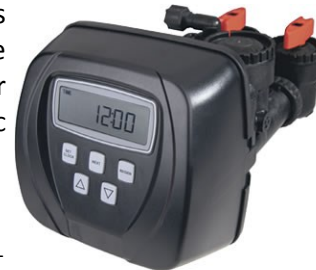
CLACK VALVE & CONTROL

A softener 'exchanges' hardness ions for harmless sodium ions, leaving soft water. A special softener resin is the exchange medium and softener salt the regenerant. When the resin becomes laden with hardness ions the softener regenerates using a salt water Solution (sodium chloride + water). The intensity of the sodium introduced dislodges and displaces the hardness ions with sodium ions. The hardness and chloride ions are sent to the drain. When the process is complete the softener is regenerated and ready again to deliver soft water. The softener cabinet acts as the storage tank for the salt and water (brine). All functions are fully automatic with only a periodic top-up of salt required.