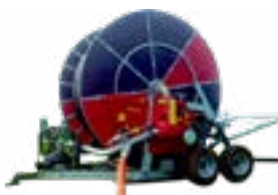
4 Wheel Chassis Version